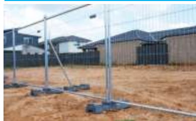
Site cost Allowance